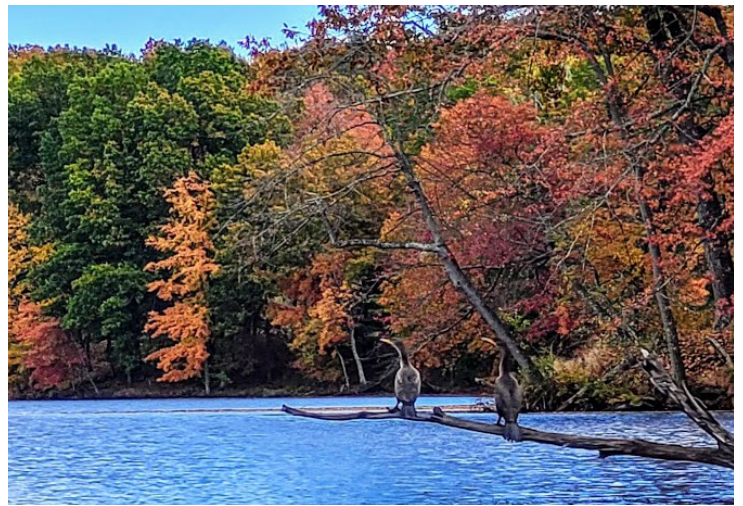
A pair of cormorants enjoying Lake Warner.